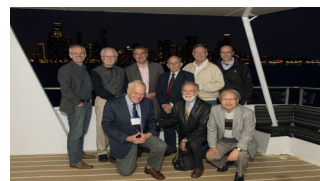
IFAC presidents past and future on boat cruise for IFAC officials at the ACC