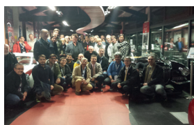
Attendees at IBCE

The workshop aimed at serving as an international forum for interaction among engineers, scientists, and practitioners of control engineering who are interested in adopting and promoting internet-based methodologies for teaching control engineering. In fact, student learning can be enhanced through the judicious and effective use of online resources and services accessible on the Internet. New Information and Communication Technology for Education provides many ways to enhance and expand educational activities and services. A wide range of educational material is now available in a variety of formats including moocs, e-books, audio and video podcasts, simulations and animations, interactive tools, virtual and remote labs, and is easily accessible through Internet. Web accessible databases and online laboratory resources allow teachers to share and reuse pedagogical material.