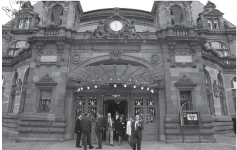
Heidelberg Convention Centre