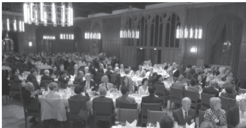
Banquet at Heidelberg Castle