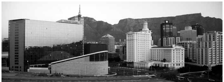
CTICC: Venue for 19th IFAC World Congress, Cape Town, South Africa