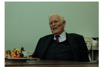
Rudolf Kalman at MICNON 2015

The conference took place in Saint Petersburg, the former capital and a historical scientific center of Russia, and one of the most beautiful cities in the world. Two sponsoring universities, Saint Petersburg State University and ITMO University, provided the venue for the conference in Vassilievsky Island, in the bottom of the historical center of Saint Petersburg. The location allowed the participants to participate in some sightseeing after the sessions.