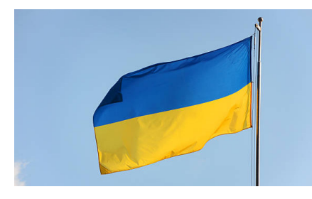
Ukranian flag photo downloaded from istockphoto.com, used with permission

The International Federation of Automatic Control (IFAC) aims to promote automatic control for the benefit of humankind. According to its mission and values of honesty and integrity, IFAC condemns this aggression and deplores its consequences.